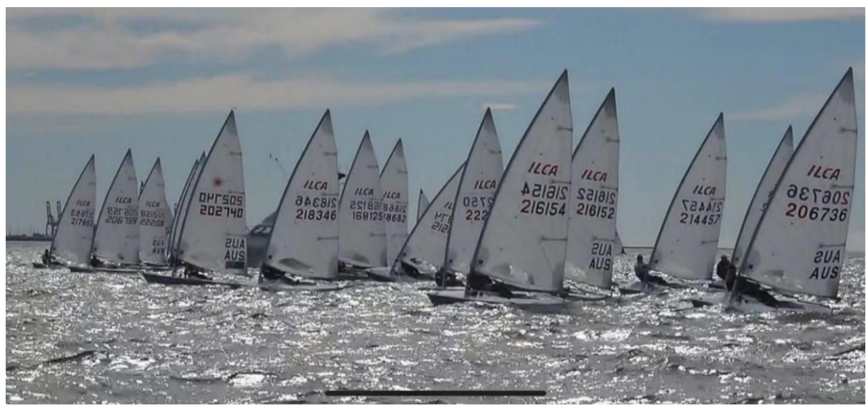
Sunday Day 3

The Queensland Laser Association's South Pacific Laser Masters rolled into seaside Brisbane once again, bringing visiting sailors from NZ, Vic, NSW and Samoa to our glorious Moreton Bay. Crisp sunny winter skies welcomed the fifty seven sailors to the green grounds of the Royal Queensland Yacht Squadron for this annual four day regatta. Regatta sponsors NB Sailsports continued their generous support and all competitors were in with a chance to win some of the over $1500 worth of ICA gear including a new sail and other ILCA gear.